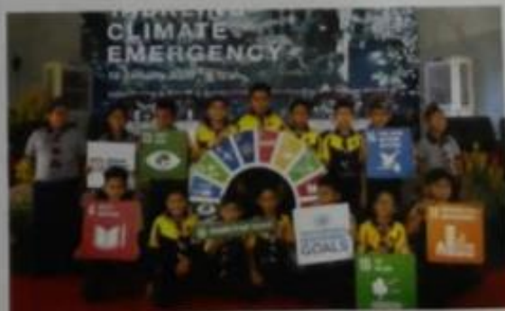
SK Medini students posing with the SDG banners