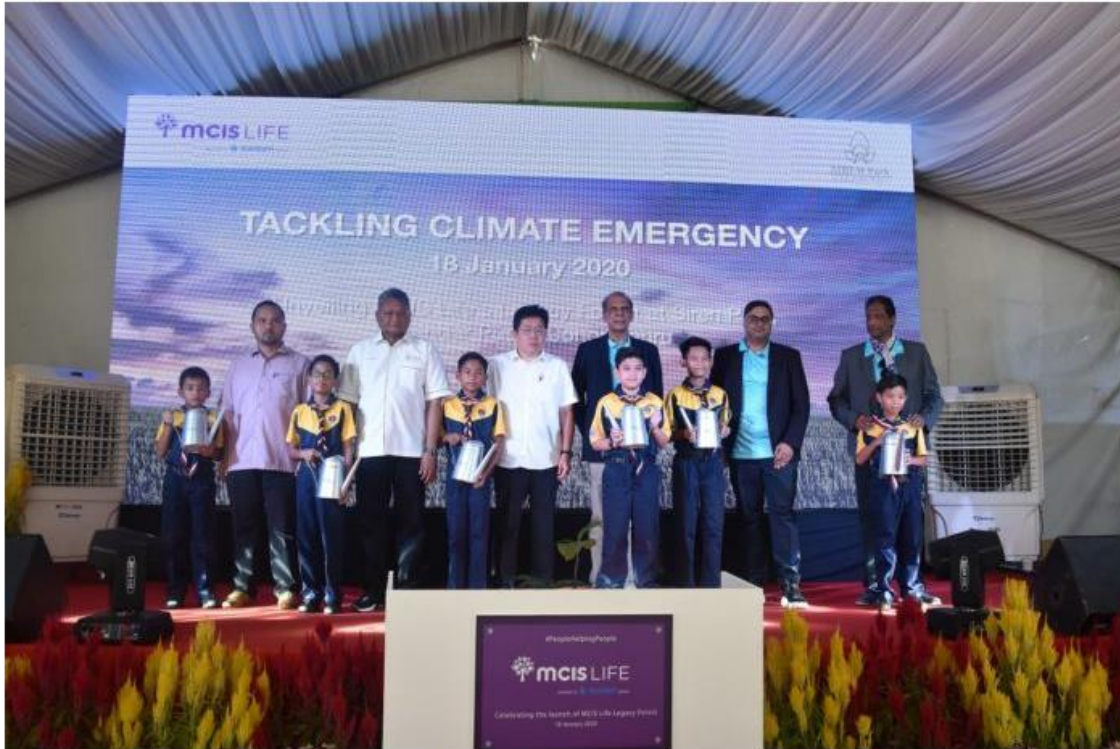
The VIPs of the events with students from SK Medini

All 380 employees of MCIS and their agents around Malaysia are also educated in their steps towards going green.