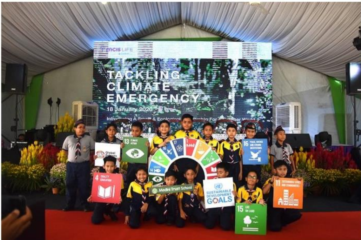
SK Medini students posing with the SDG banners